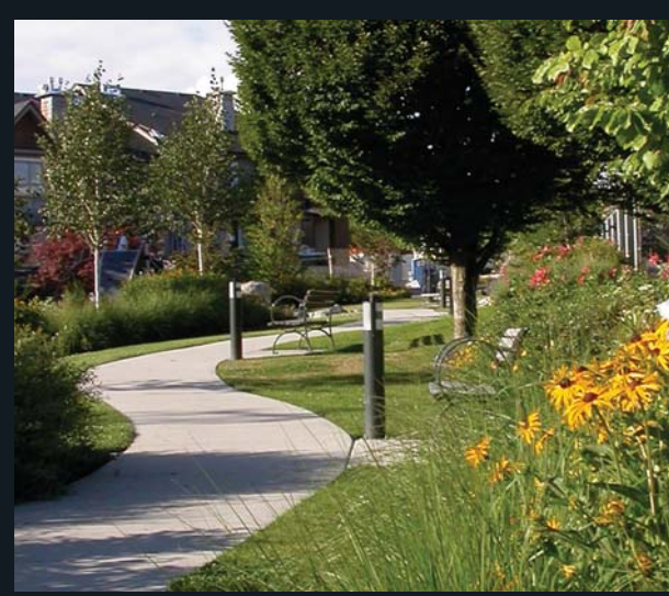
designed by allegory